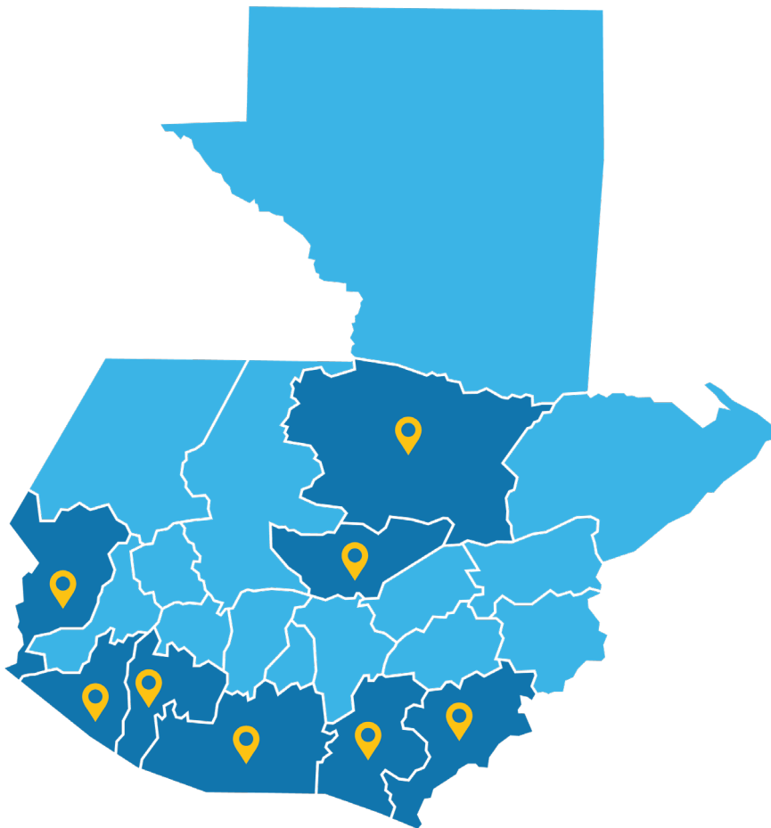
Figure 01 ICIAAD's geographic focus for the five years from 2025 to 2030

From 2025 to 2030, ICIAAD will focus its efforts in eight departments of Guatemala, as illustrated in Figure 01.